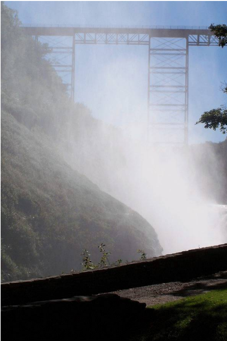
Train trestle – not an allowed way of crossing the gorge!