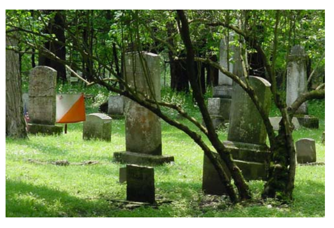
Interesting flag location at the Letchworth meet