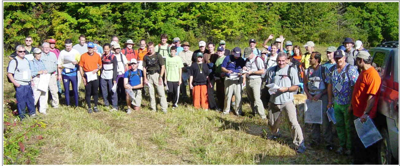
Rogaine 2005 -- The eager participants in the Rattlesnake Hill Rogaine, seconds before the start.