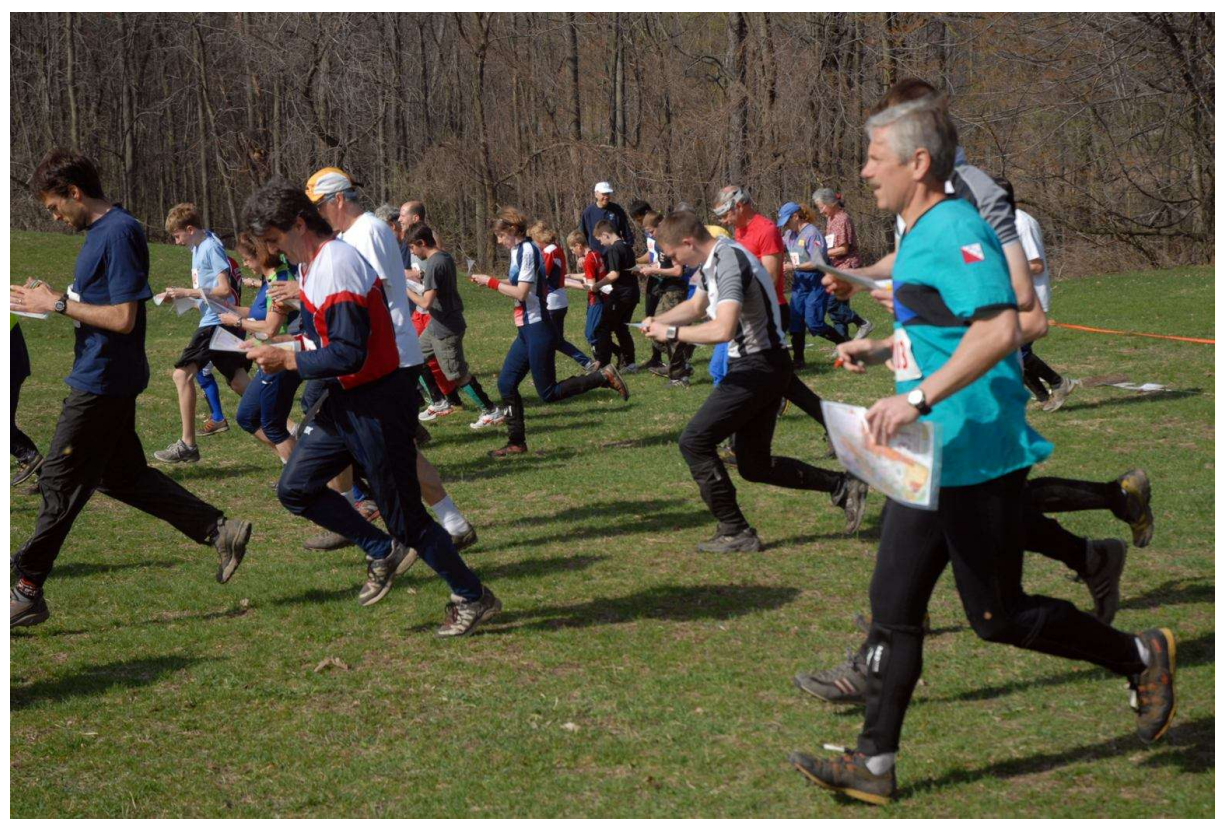
The start of the US Relay Championships, at Mendon Ponds Park.