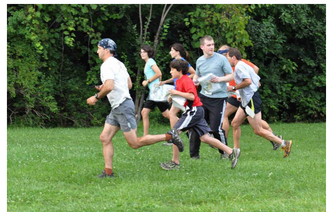
At the start of the Score-O at Black Creek.