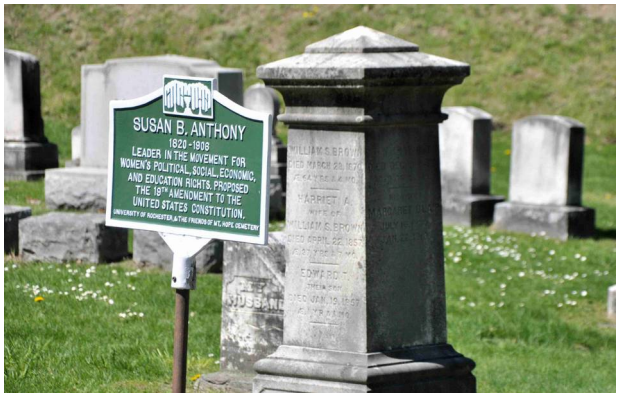
Question 15: "On the sign beside the road, what is the last on the list of women's rights Susan B. Anthony fought for?"