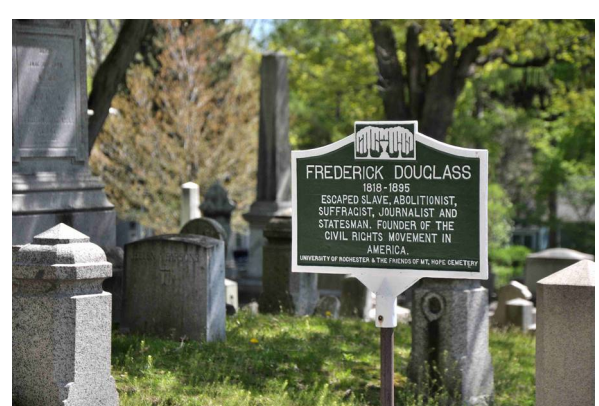
Question 16: "What is the first of 5 terms describing Frederick Douglass?"

There were 82 control points, located in the central and southeast portion of Rochester, including the south wedge, Corn Hill, downtown, the Neighborhood of the Arts, East Avenue, Park Avenue, Monroe Avenue, Cobb's Hill Park, Highland Park, and Mt. Hope Cemetery.