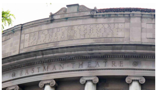
Question 52: "What is the Roman numeral high up on the NW side of the building?"