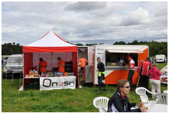
Some O-Fest food choices

flags but you couldn't leave the trail. Judging contours from a distance was challenging and with the added twist that possibly NONE of the flags matched the map, you really had to pay attention to judging distances as well. It was a great exercise in paying attention to details.