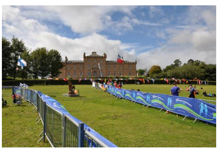
The finish chute and final control for the Darnaway middle distance course

Since I was in the recreational starts, I didn't have a specific start time and just had to find the correct line