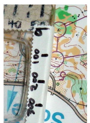
Option 2: Meter scale. Distance is a little over 100 meters.