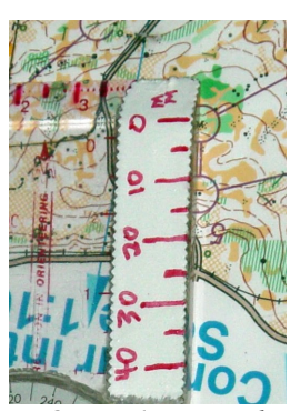
Option 1: mm scale. Distance is about 11 mm.