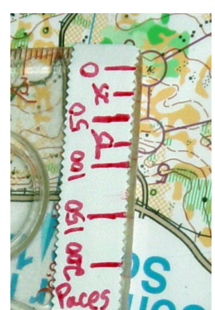
Option 3: Pace scale. Reads between 50 and 75.

3. Devise a scale that reads in paces (as with option #2, you need a different scale for different map scales). This shows that the distance between 5 and 6 is about midway between the "50" and the "75" on the scale, so my pace count would be approximately 68 or so.