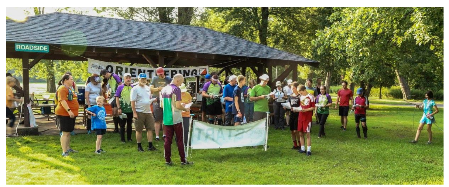
Hopefully we'll be gathering again like this in 2021!